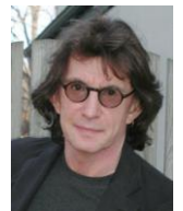
Dr. Henry Giroux

One of the highlights of the opening ceremonies was the Keynote address by Dr. Henry Giroux, the renowned scholar, researcher and author who currently holds the Global TV Network Chair Professorship at McMaster University in the English and Cultural Studies Department. Dr. Giroux's talk on the topic " Changing Society through Scholarship " was well attended by members of Brock University community including Joint PhD students and faculty. Dr. Giroux's inspiring lecture which was video-taped is available on-line at the Joint PhD website as well as on iTunes/podcast at Brock University website.