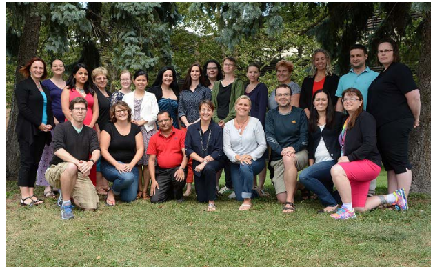
Doctoral Seminars I & II students and instructors during the 2014 Summer session held at the University of Windsor, Windsor, Ontario.