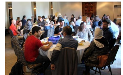
Orientation Breakfast, 2017 Summer Session at the University of Windsor